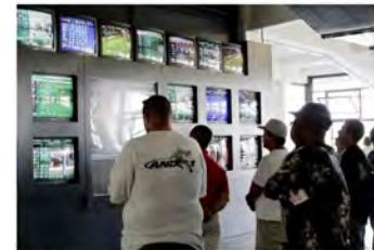
Fans watched horse racing at Monmouth Park in Oceanport, N.J., in 2016. New Jersey wants sports betting, partly to bolster its ailing horse racing industry.